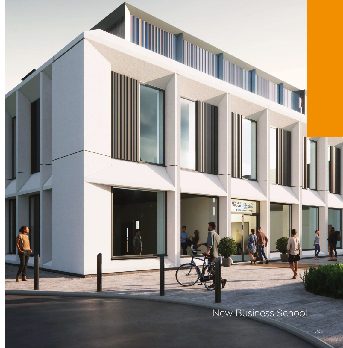
New Business School