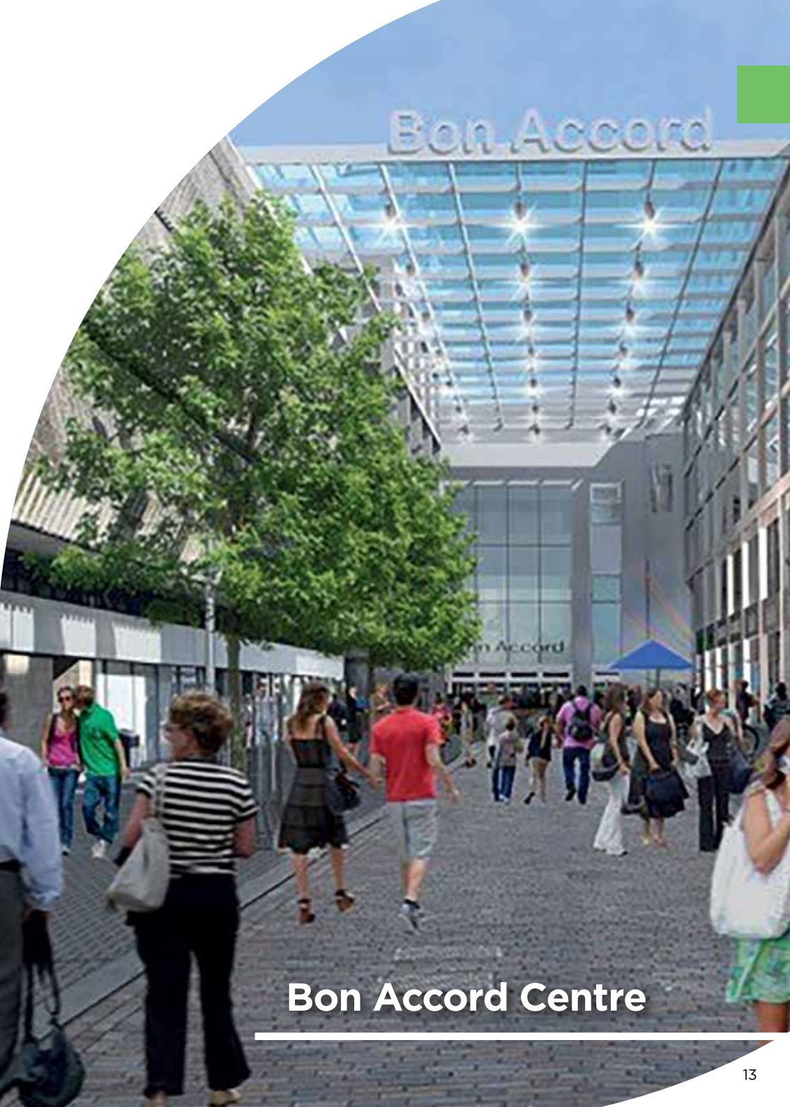
Bon Accord Centre