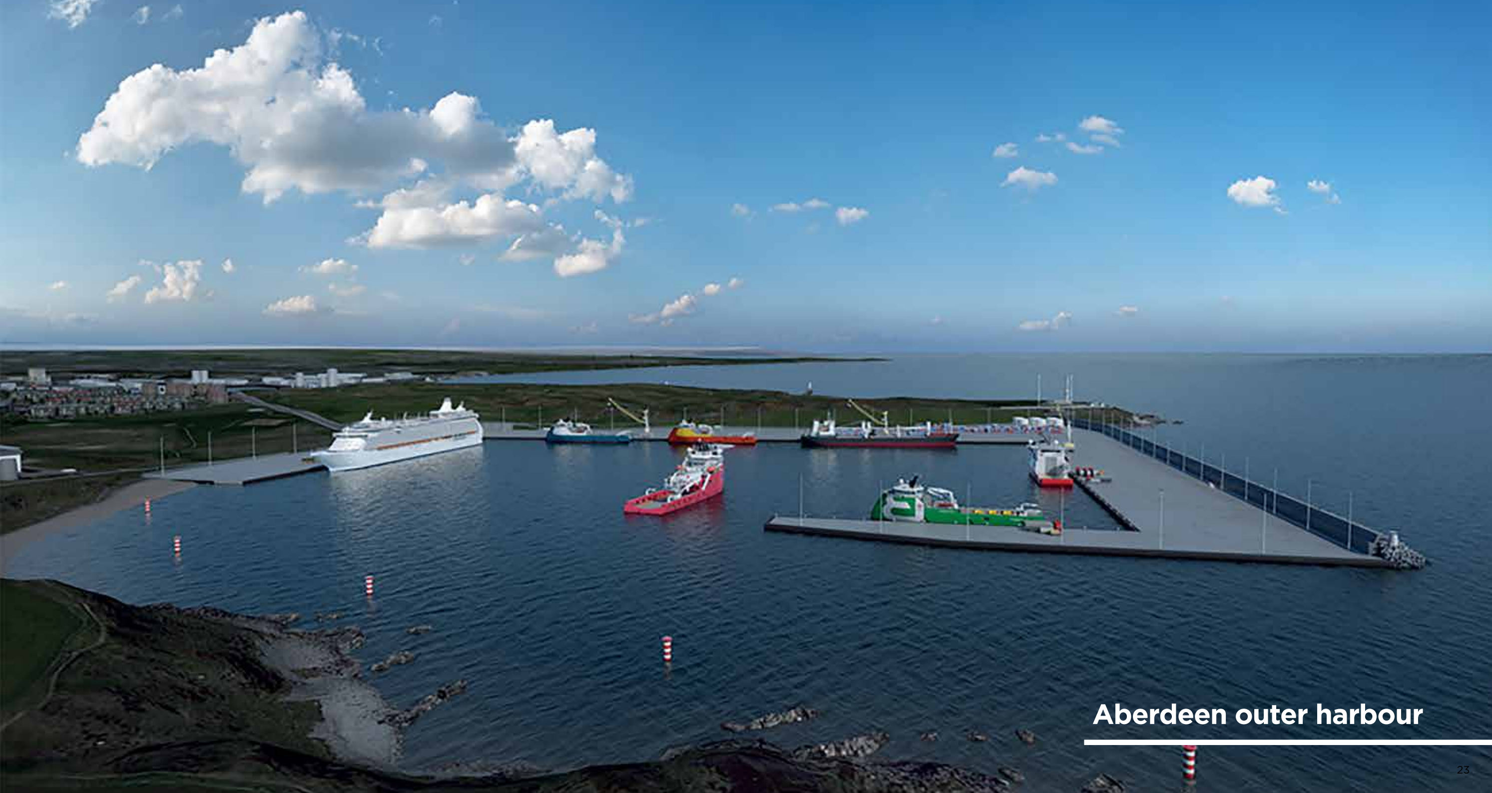
Aberdeen outer harbour