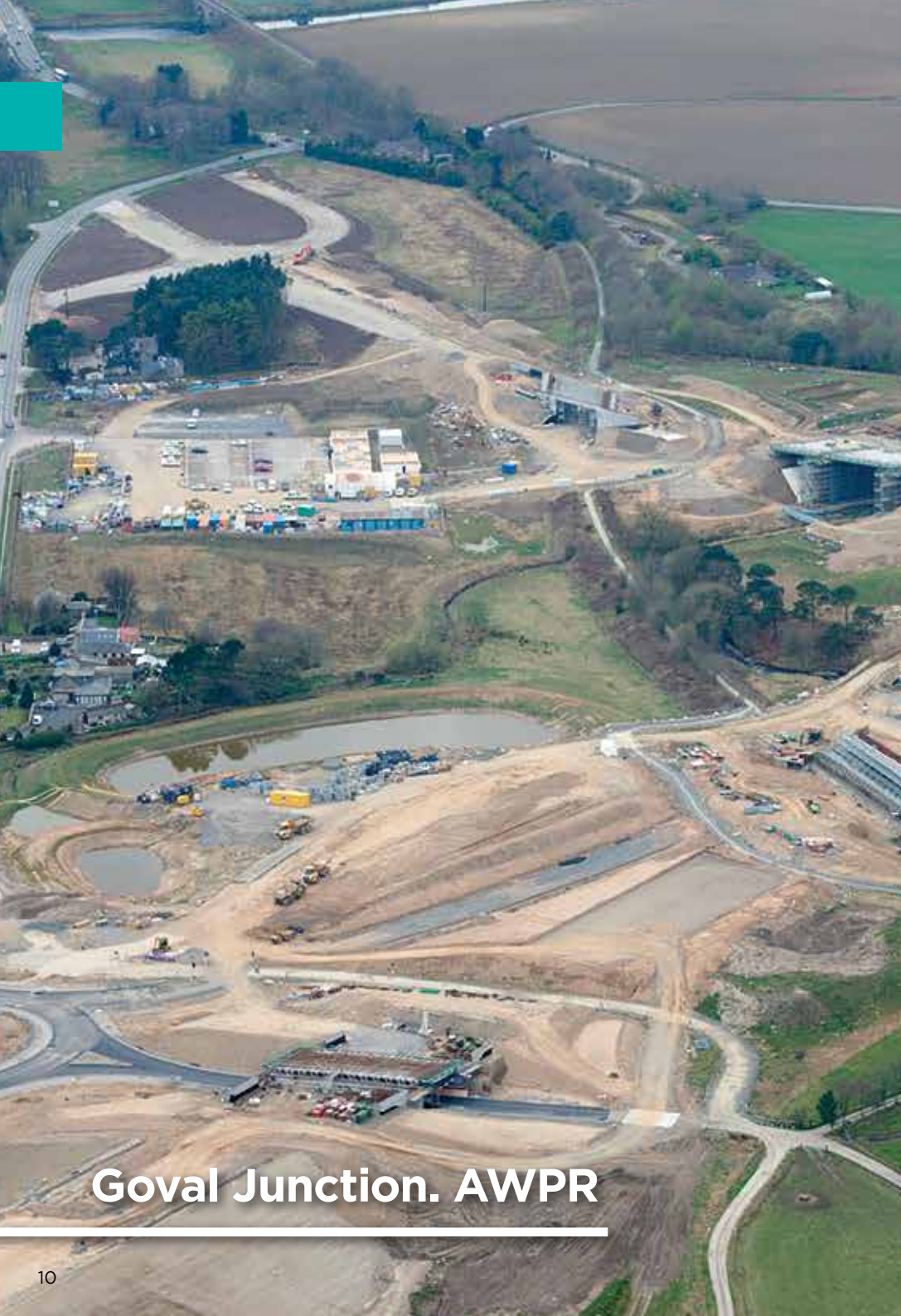
Goval Junction. AWPR