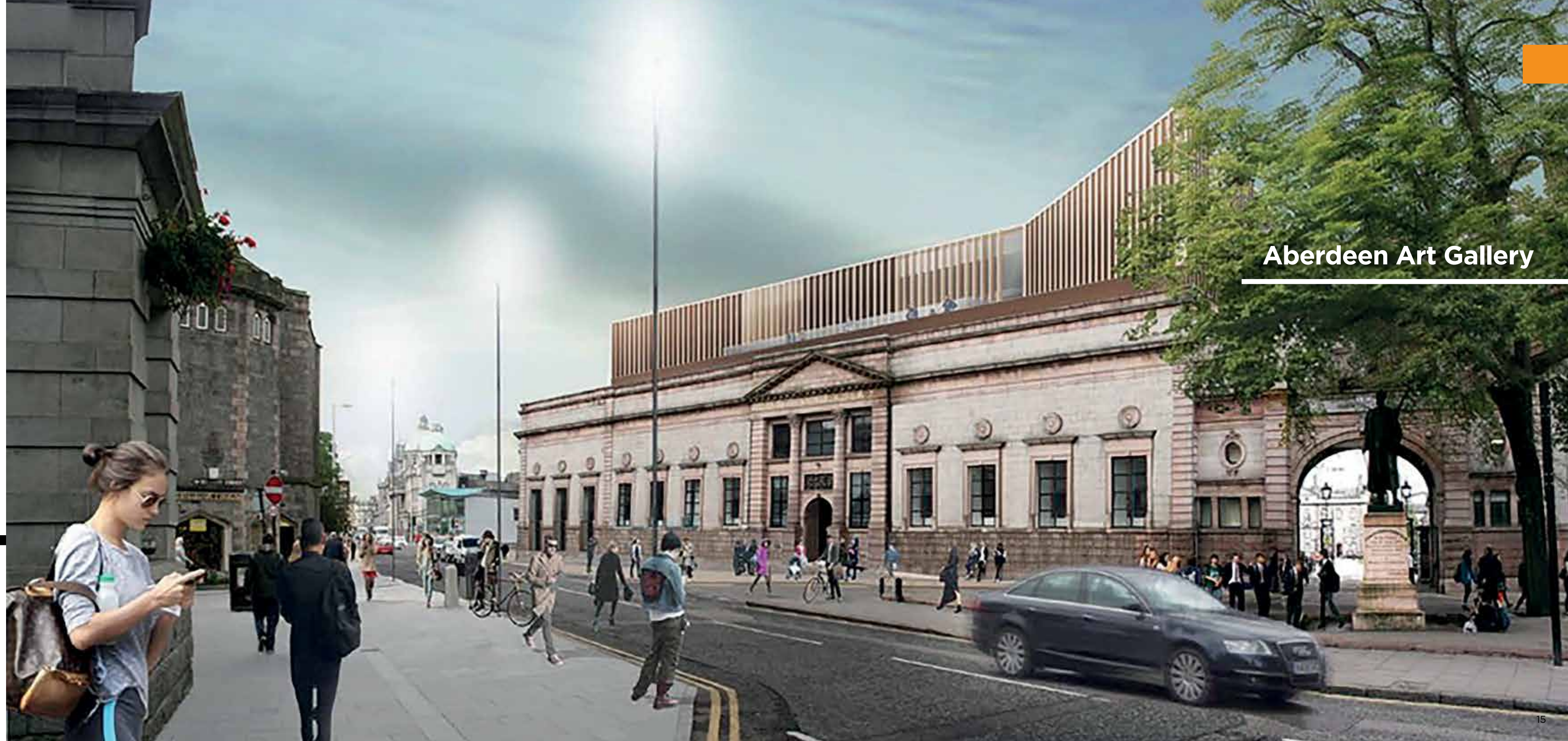
Aberdeen Art Gallery