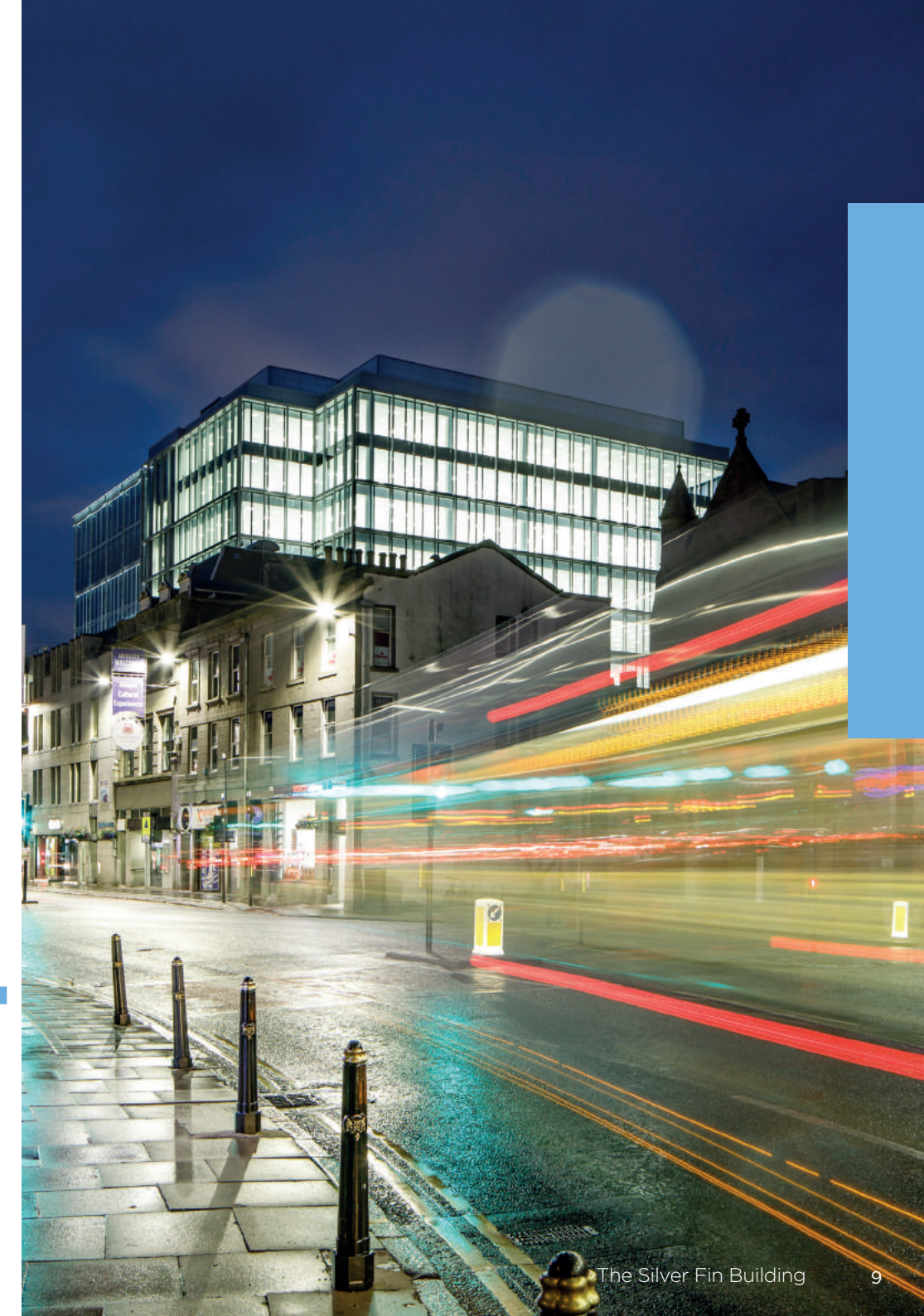
The Silver Fin Building