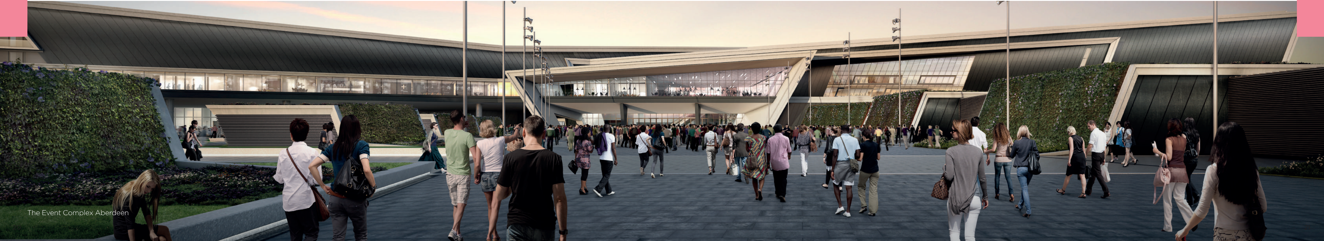
The Event Complex Aberdeen