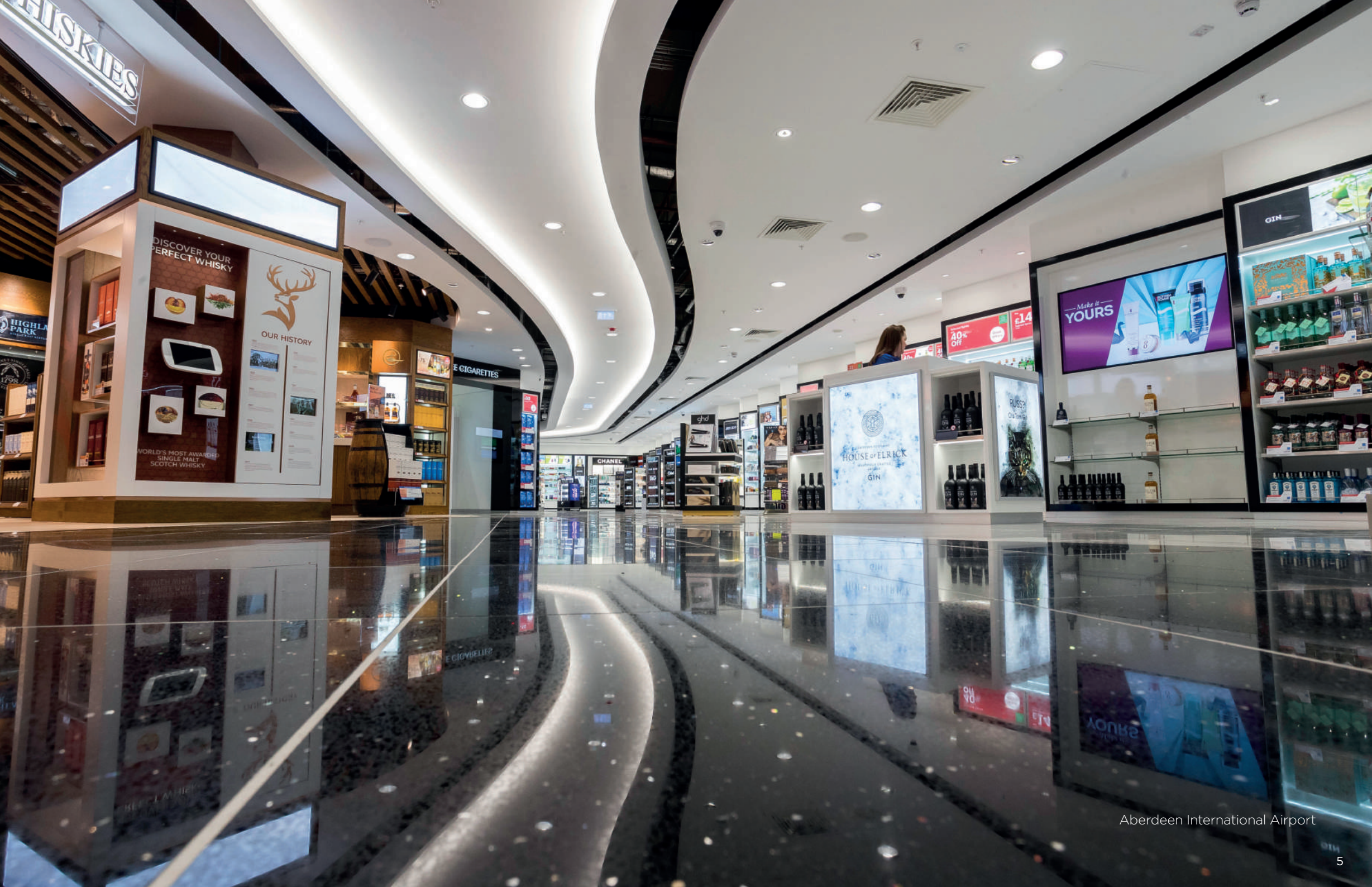
Aberdeen International Airport