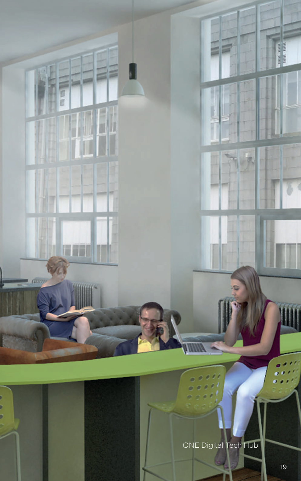
ONE Digital Tech Hub