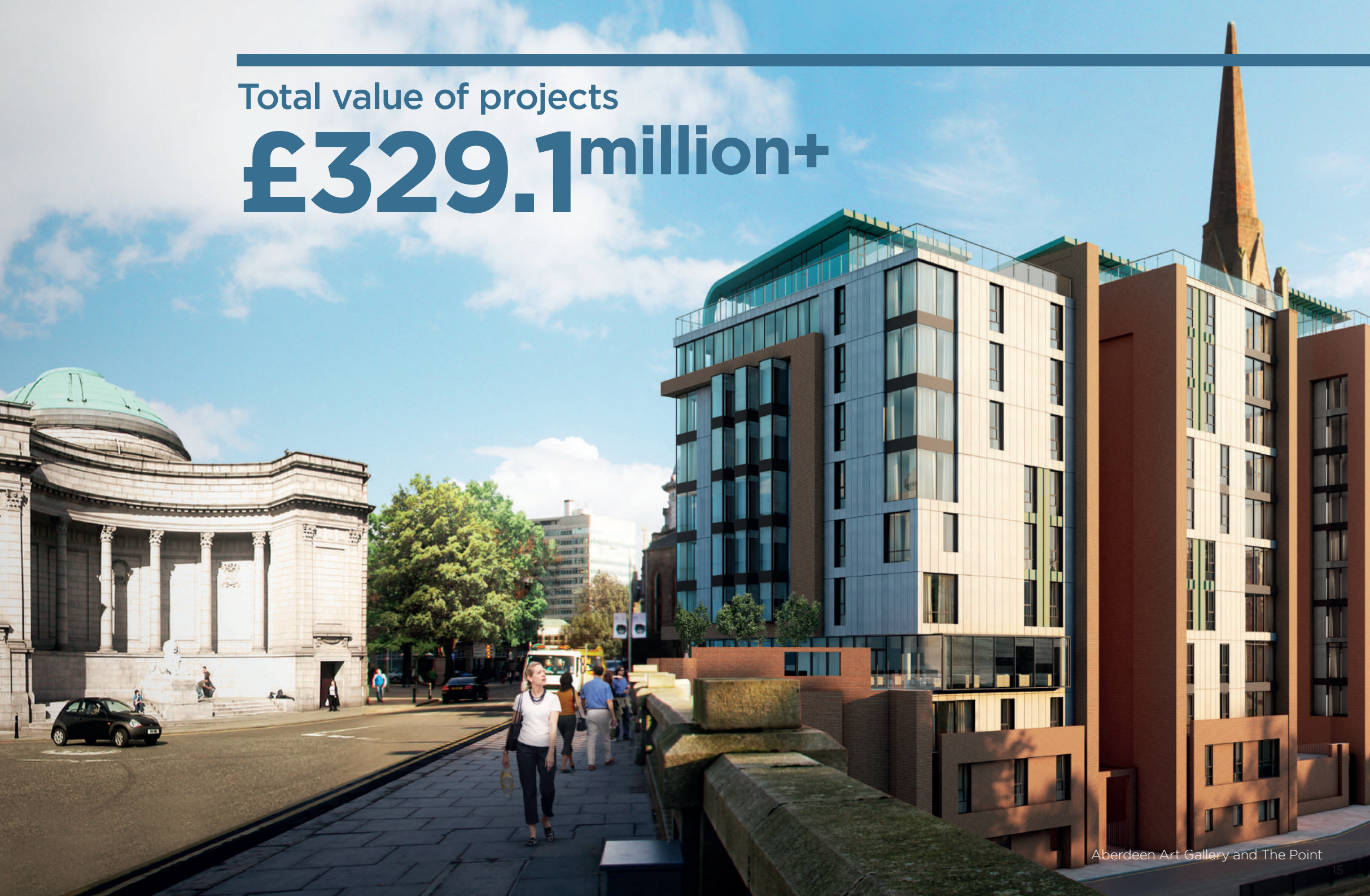
Aberdeen Art Gallery and The Point