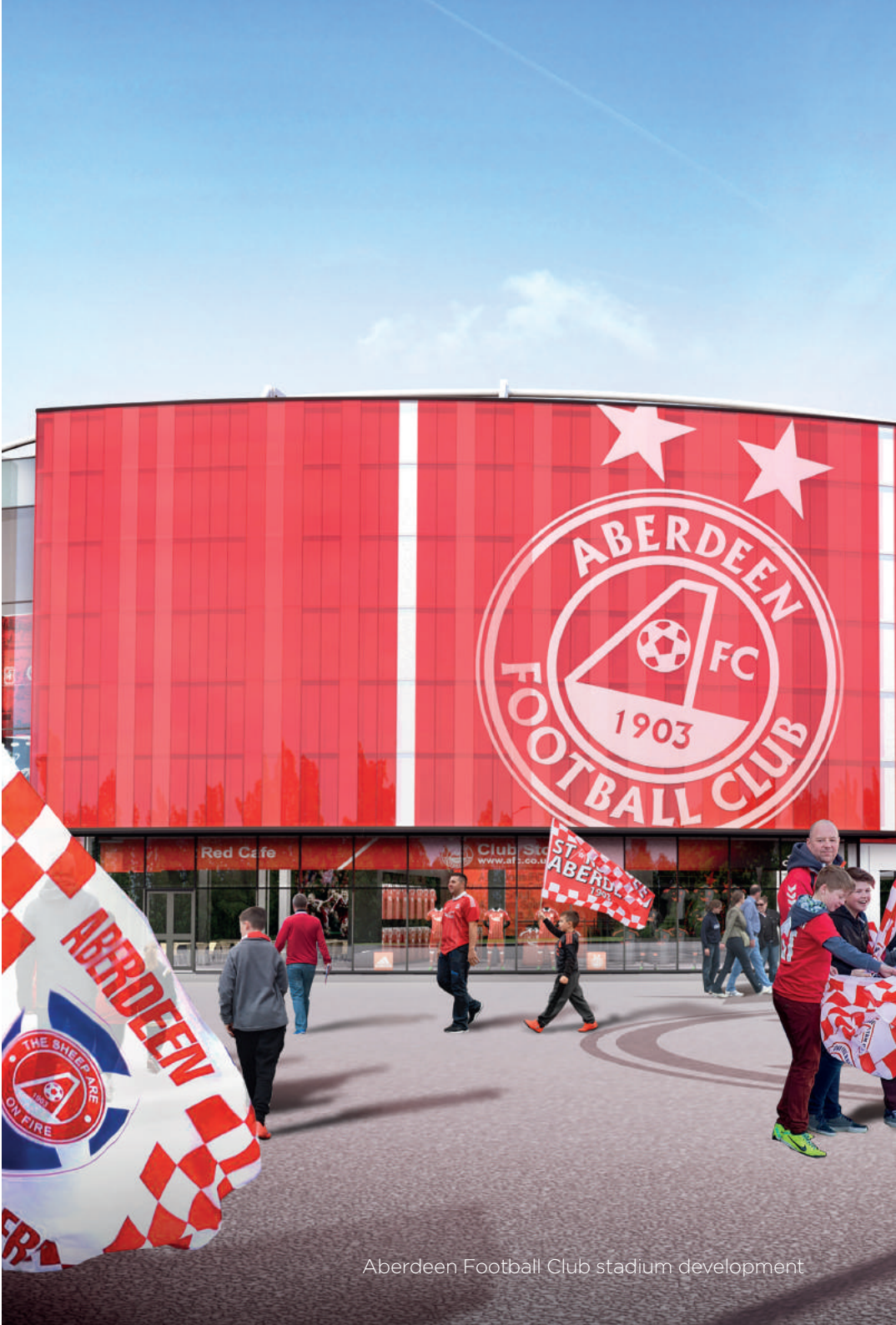
Aberdeen Football Club stadium development