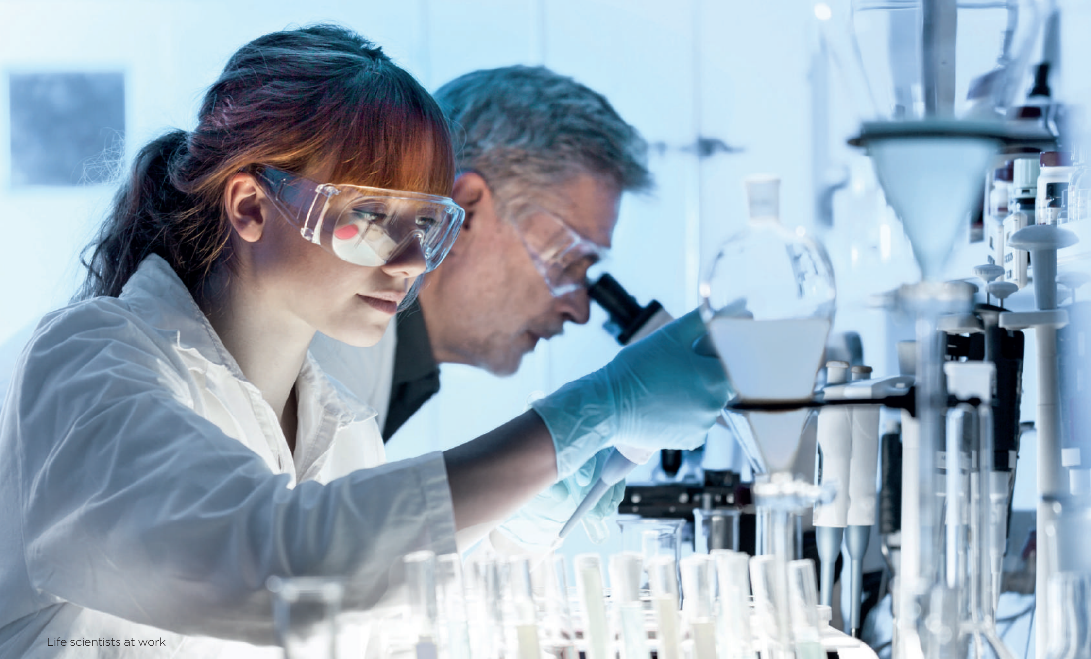
Life scientists at work

*The Aberdeen City Region Deal comprises funding of £250million split evenly between the UK and Scottish Governments. In addition the Scottish Government and our local authorities committed further amounts, bringing the total to £524million. To date it is forecast this initial investment has so far attracted additional matched funding of £245million, totalling circa £769million.